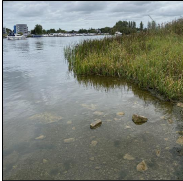
PLATE 1. Golden Mile, Athlone, River Shannon, County Westmeath, 18 September 2022.