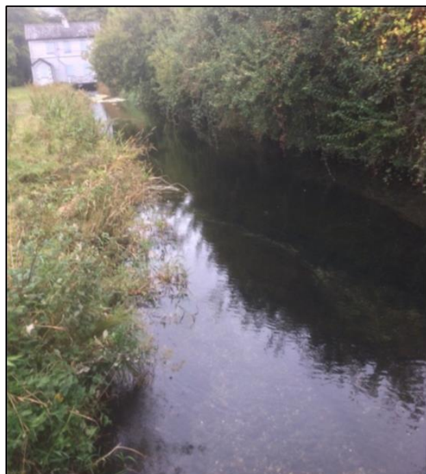
PLATE 2. The Sluice House and the Royal Canal Supply from Lough Owel, County Westmeath, 25 September 2022. Oxyethira tristella was taken on this stretch.