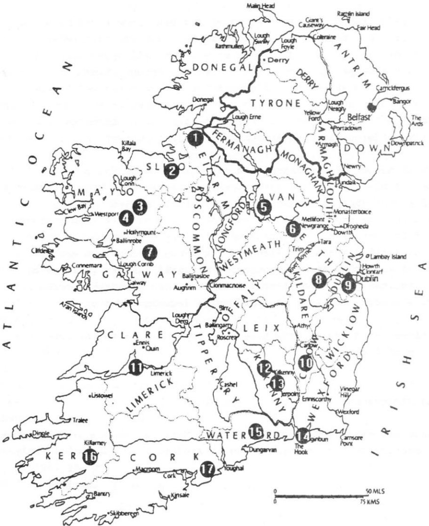
FIGURE 1: Map of Ireland showing localities of larval samples (numbers correspond to the numbered localities in the text).