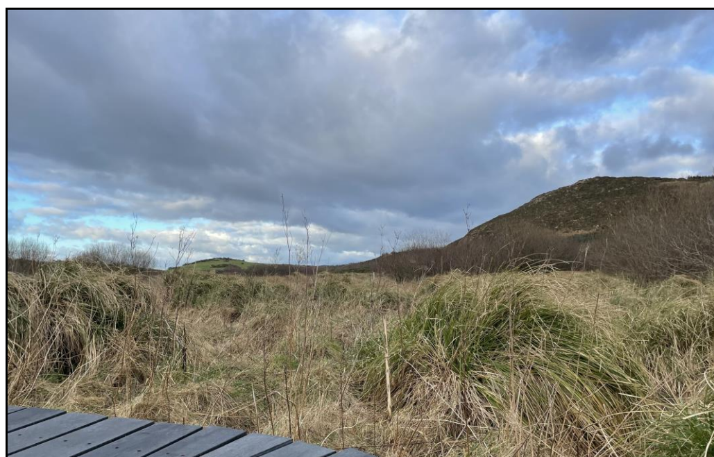
PLATE 1. Views of Fenor Bog, County Waterford. Above. The pond on the southern side. Below. Looking north from the walkway. 28 January 2025.