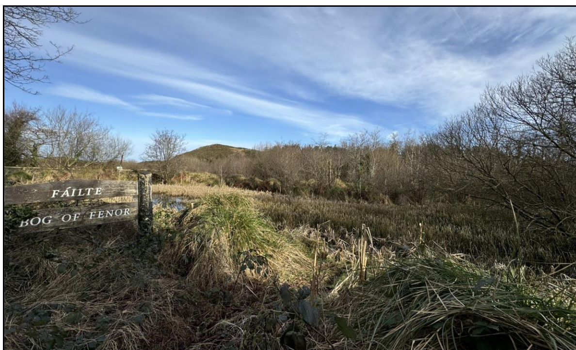
PLATE 2. Views of Fenor Bog, County Waterford. 30 January 2025.