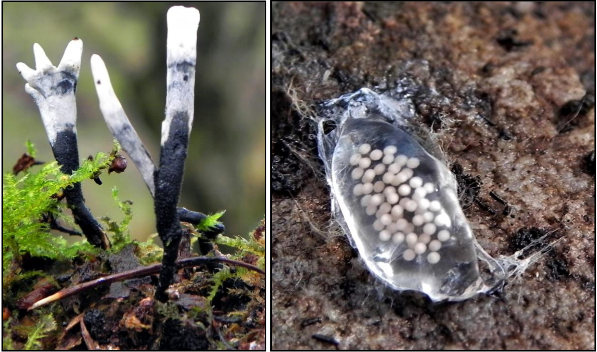
PLATE 3. Left: Xylaria hypoxylon Candlesnuff fungus, Ballywilliam. Right: Argonemertes dendyi egg clutch, Ballywilliam.