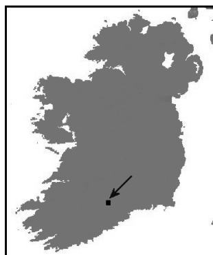
FIGURE 1. The location of the study site.