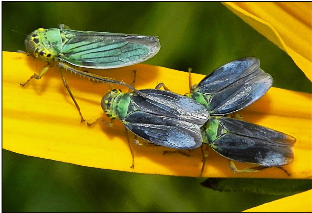
PLATE 4. Cicadella viridis , Ballywilliam.