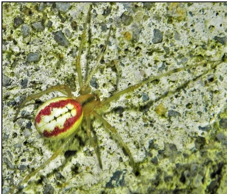
PLATE 8. Enoplognatha ovata / E. latimana var. redimida , Ballywilliam.