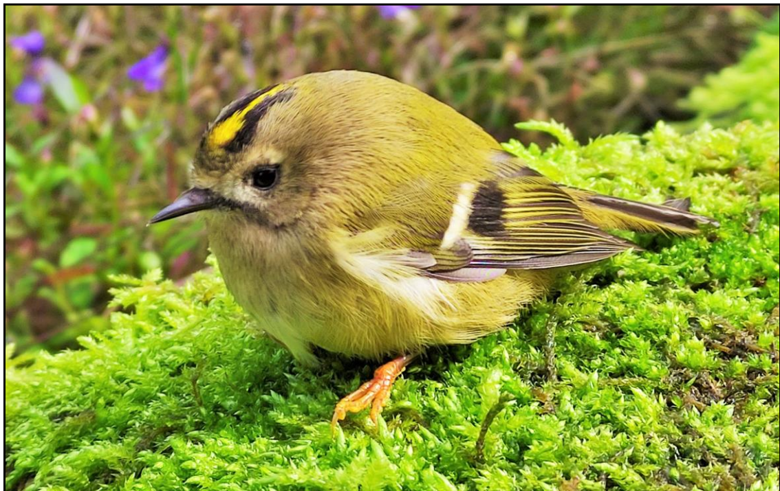
PLATE 6. Regulus regulus , Ballywilliam.