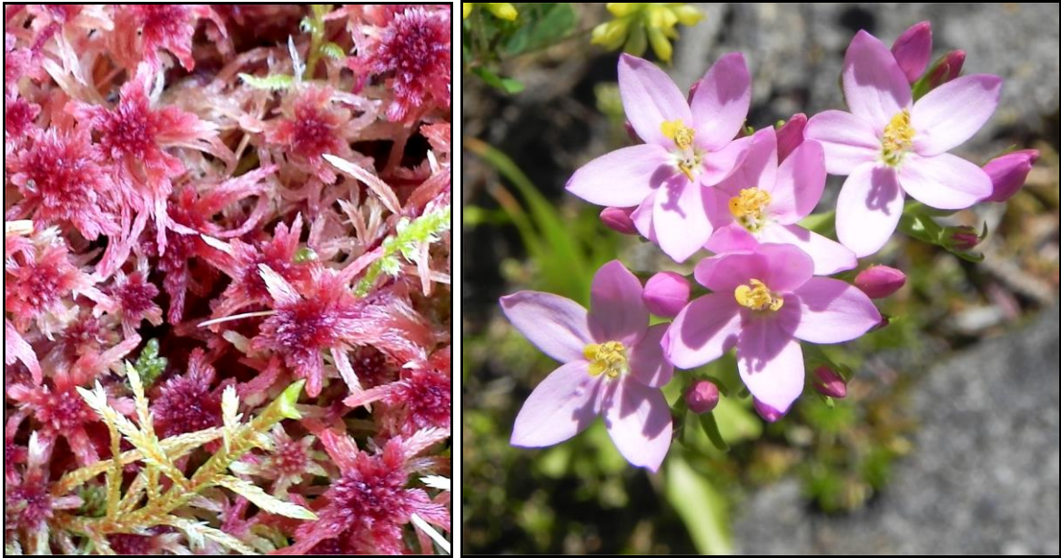
PLATE 5. Left: Sphagnum rubellum + Pleurozium schreberi , Ballywilliam. Right: Centaurium erythraea , Ballywilliam.