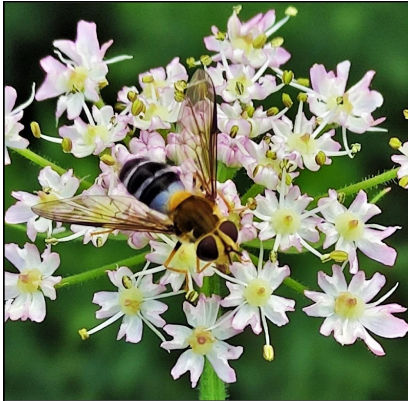
PLATE 7. Leucozona glaucia , Ballywilliam.