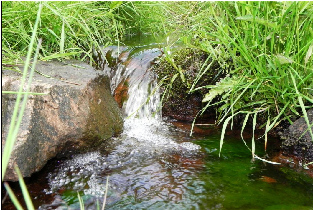
PLATE 1. One of the small streams, Ballywilliam.