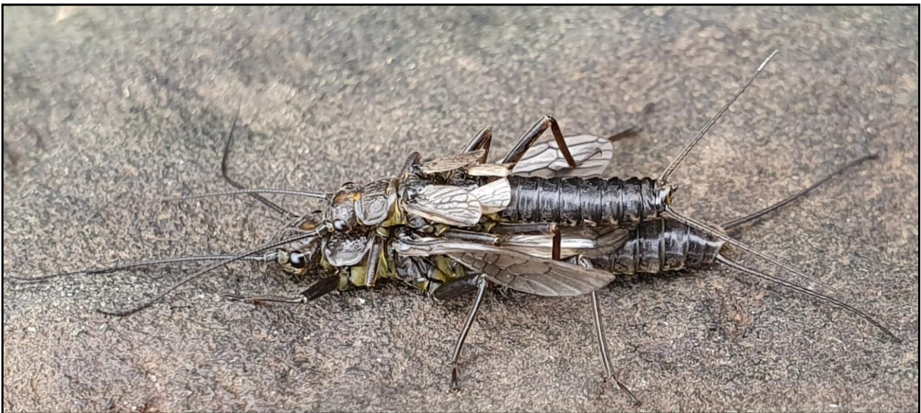
PLATE 2. Adult male (top) and female (bottom) of Diura bicaudata (Linnaeus) exhibiting microptery and brachyptery, respectively. Lough Conn, 26 June 2021.