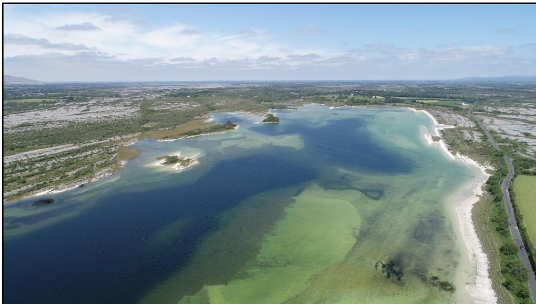
PLATE 2. A hard limestone lake. Lough Bunny, County Clare.