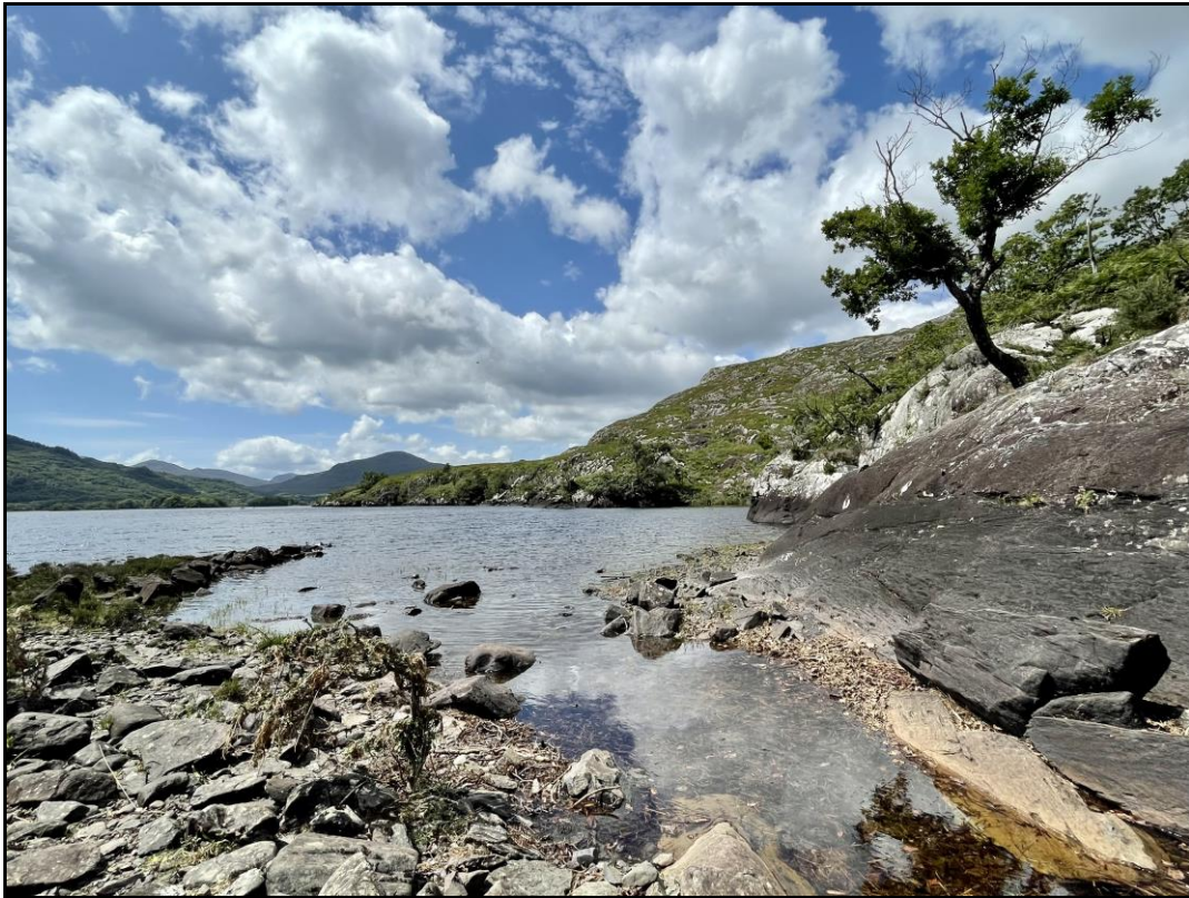
PLATE 1. An acid lake. The Upper Lake, Killarney, County Kerry.