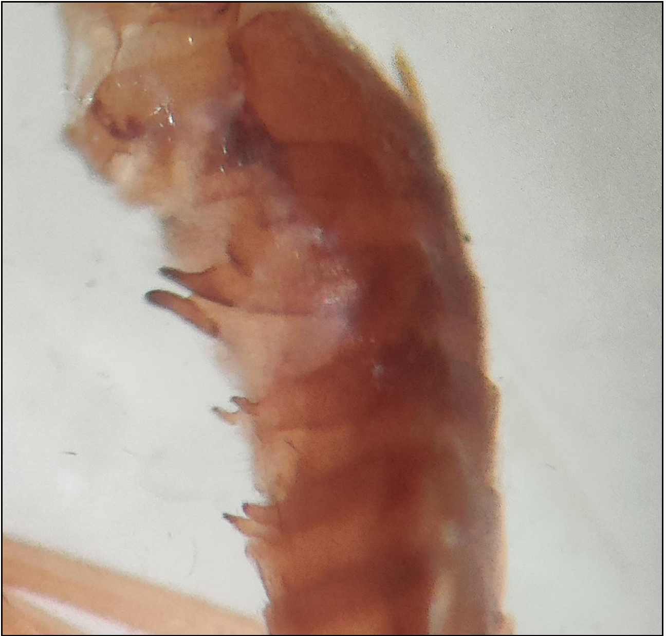
PLATE 3. Lateral view of additional upstanding processes on tergite VII characteristic of a male Leuctra nigra f. hibernica after Feeley et al. (2024), the dominant form of adult males in Ireland. Adult male L. nigra sensu stricto only have upstanding processes on tergites VI and VIII.